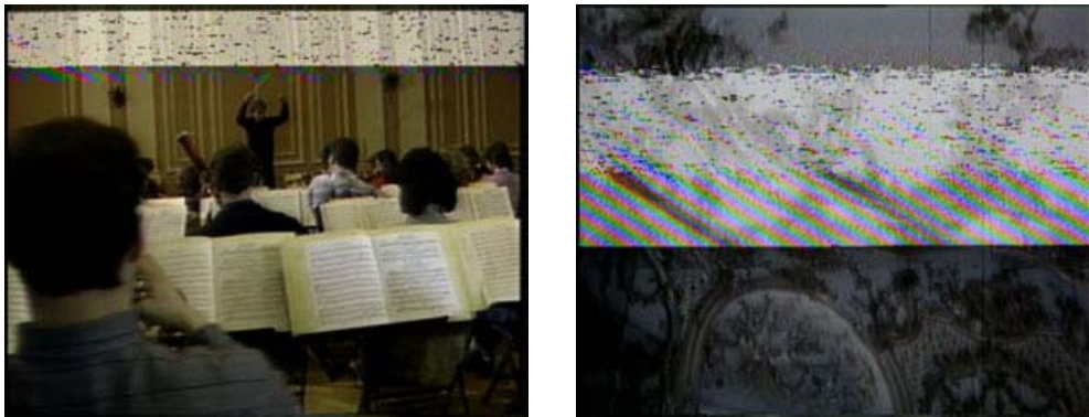
Image 1- both signal problems present in the video sequence

The tape presented 2 errors; each of them located in the top half of a single frame.