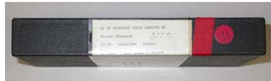
Image 3- Cover of the tape 43/4-SM